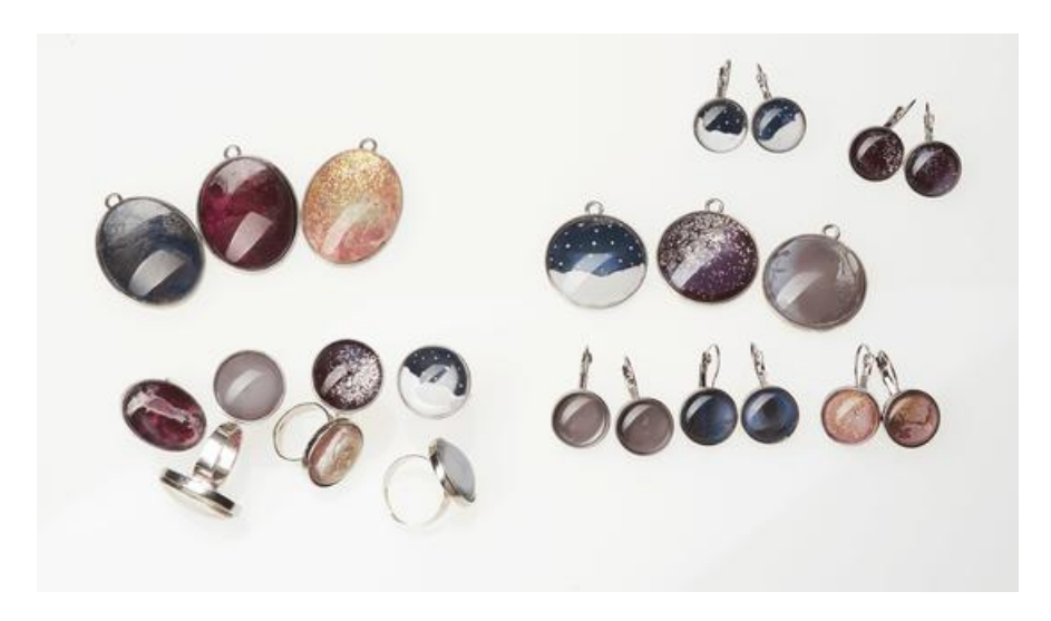
Step 5: Allow the glue to dry. Finally, you can apply natural Paint your fingernails with the same nail polish and create an individual look .