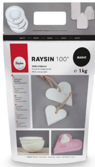
Casting powder "Raysin 100", white, 1 kg