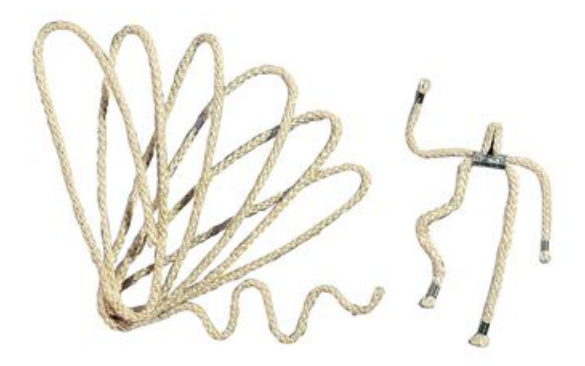
Figure wire, Ø 8 mm 10,65 CHF (1 m = 2,13 CHF) Item details Quantity: 1