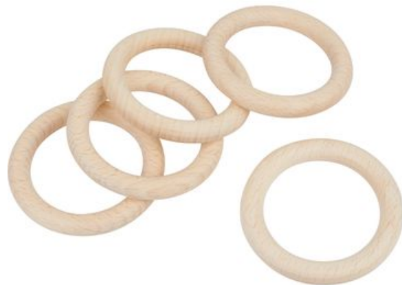
Wooden rings, Ø 70 mm, 5 pieces